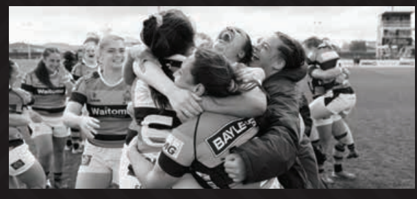
Thriving people, thriving game