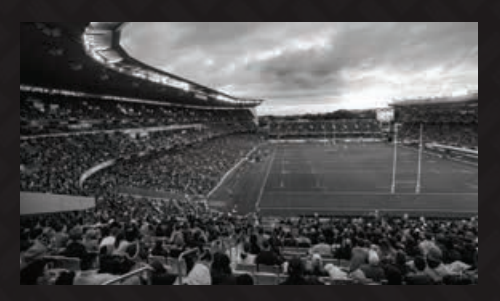
Unleashing rugby's commercial potential