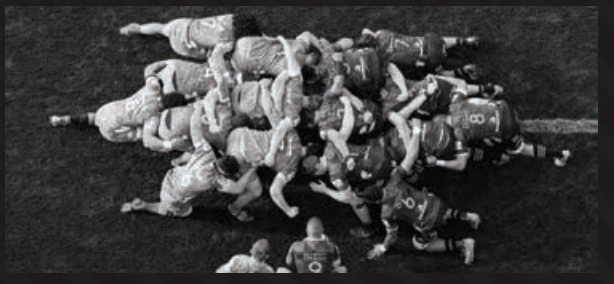
Enhancing the welfare of our players