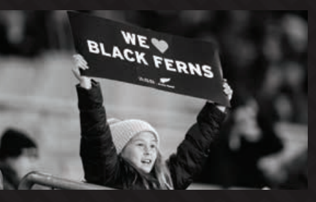
Loved game, loved brands