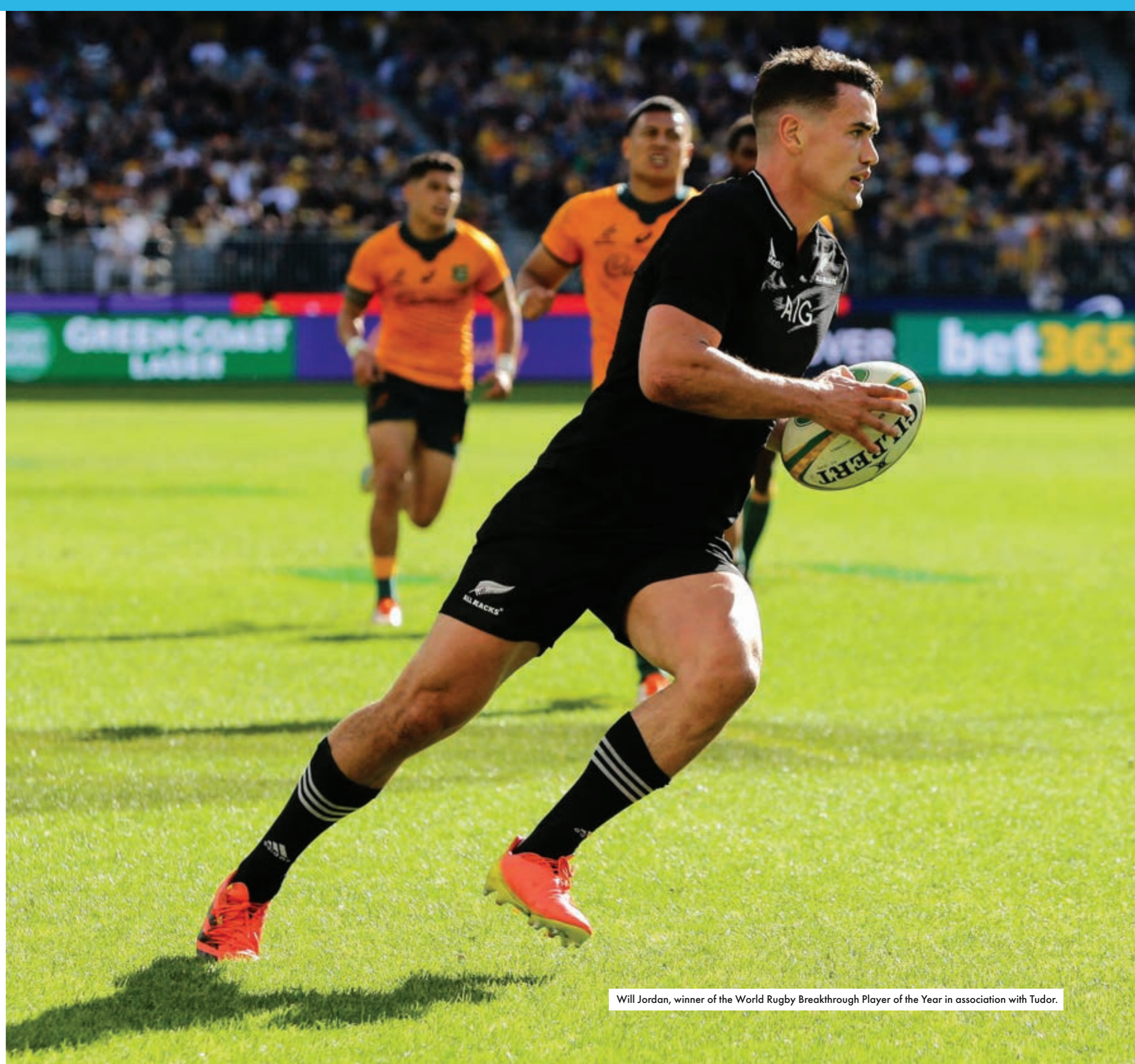
Will Jordan, winner of the World Rugby Breakthrough Player of the Year in association with Tudor.