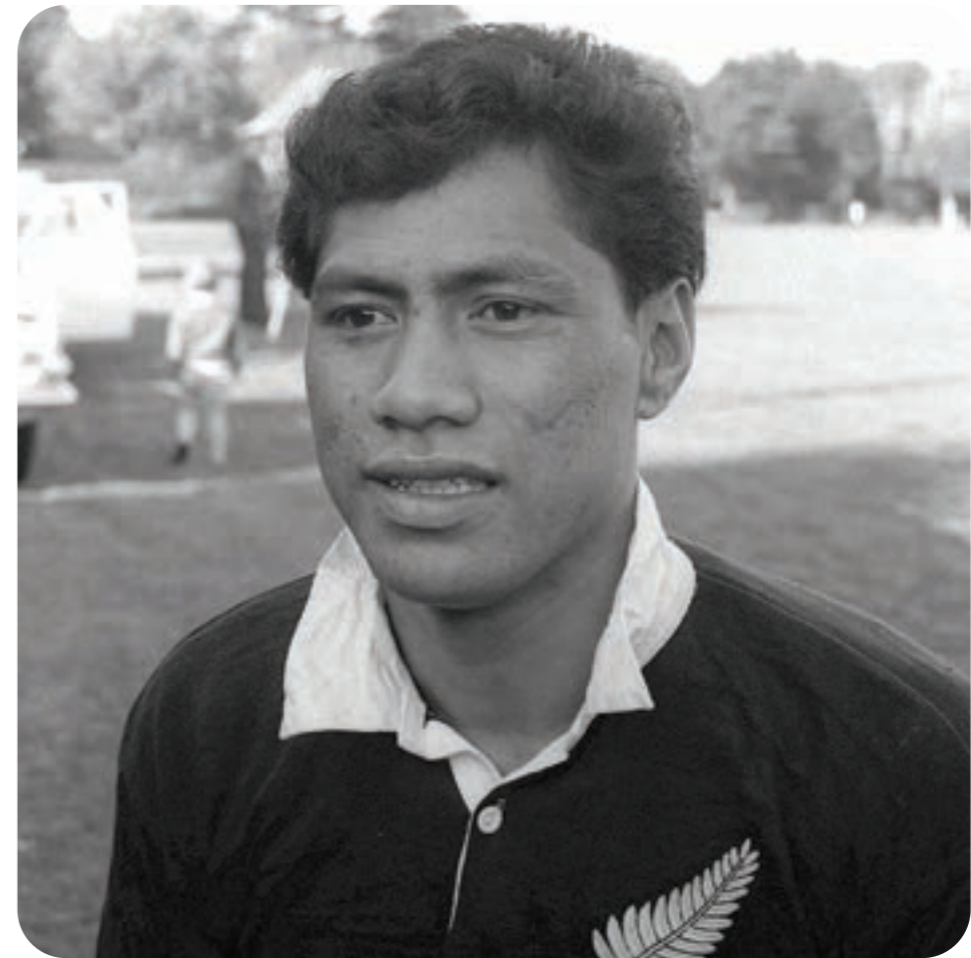
Waka Nathan All Black #627 24 September 2021, aged 81

Waka Nathan's contribution to rugby spanned over six decades. He was a tough and fiercely respected player for Auckland, Māori All Blacks and All Blacks, and never played in a losing test match. Upon retiring as a player, he continued to impact the game as a selector, manager