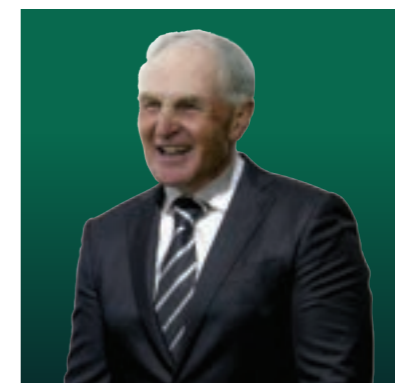
Ian Kirkpatrick Patron

The New Zealand Rugby Patron fills an honorary role as the figurehead for the organisation. Throughout the 20th century the Governor General traditionally held the role of Patron. Ian Kirkpatrick has been Patron since 2020.