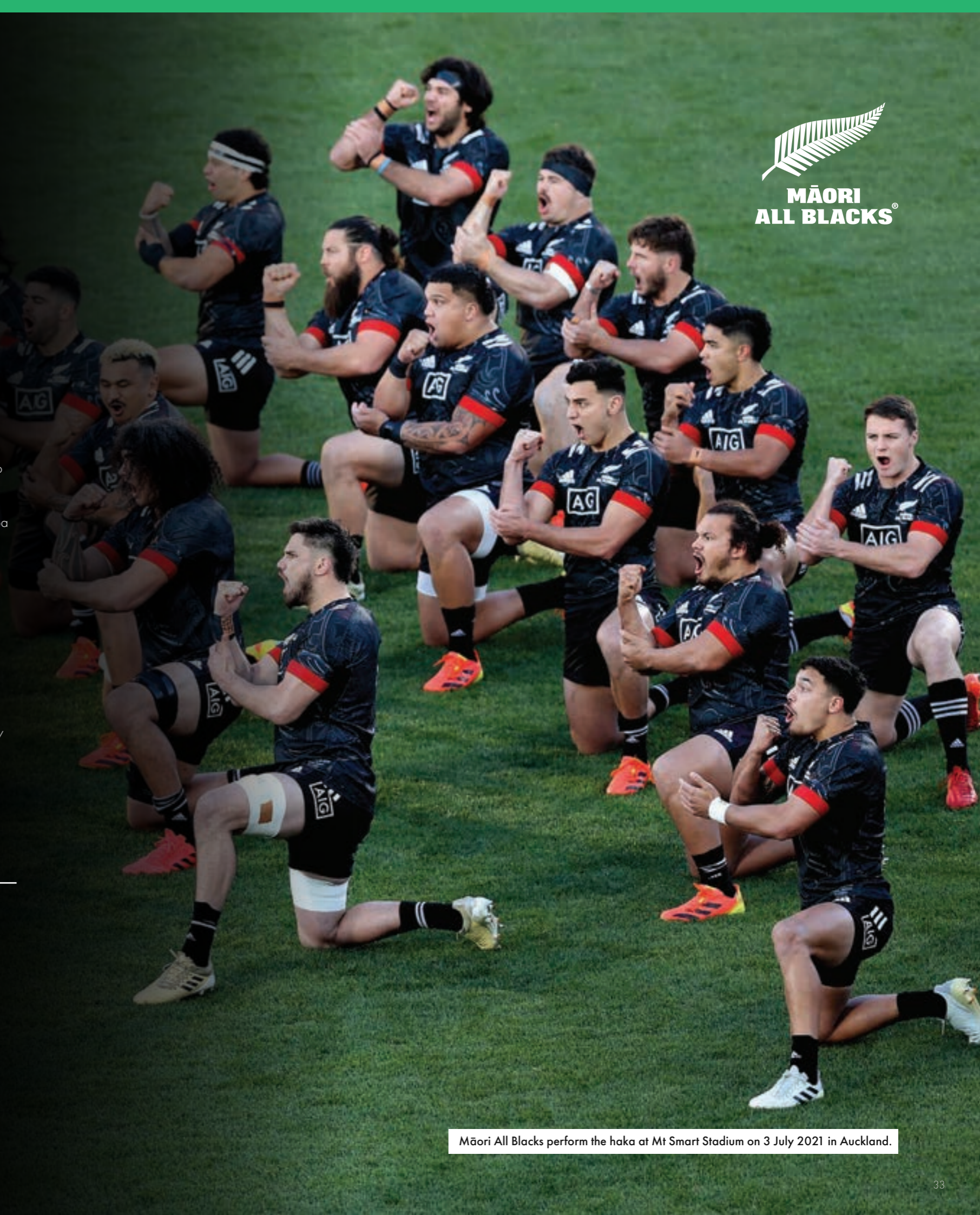
Māori All Blacks perform the haka at Mt Smart Stadium on 3 July 2021 in Auckland.