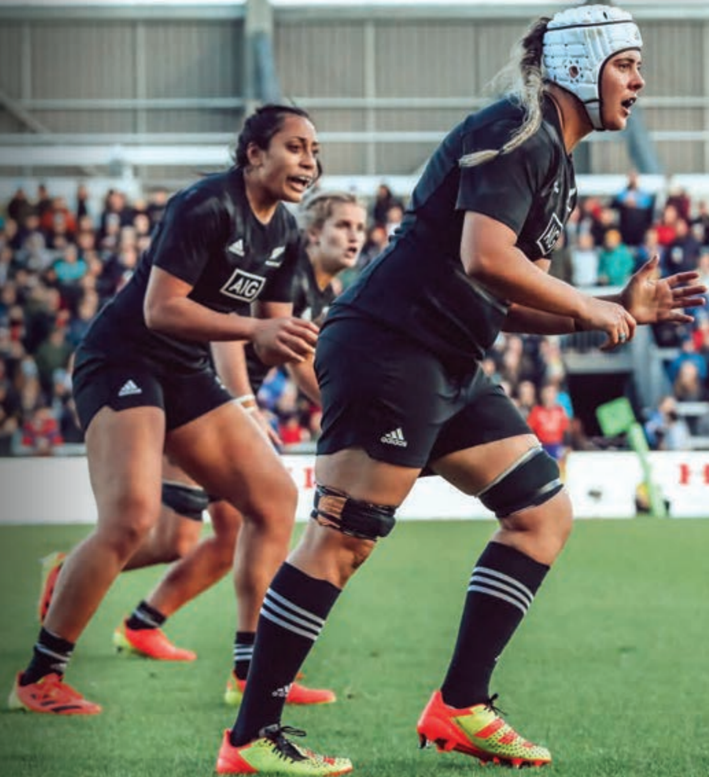
The Black Ferns ready to attack against England on 1 November 2021 in Exeter.