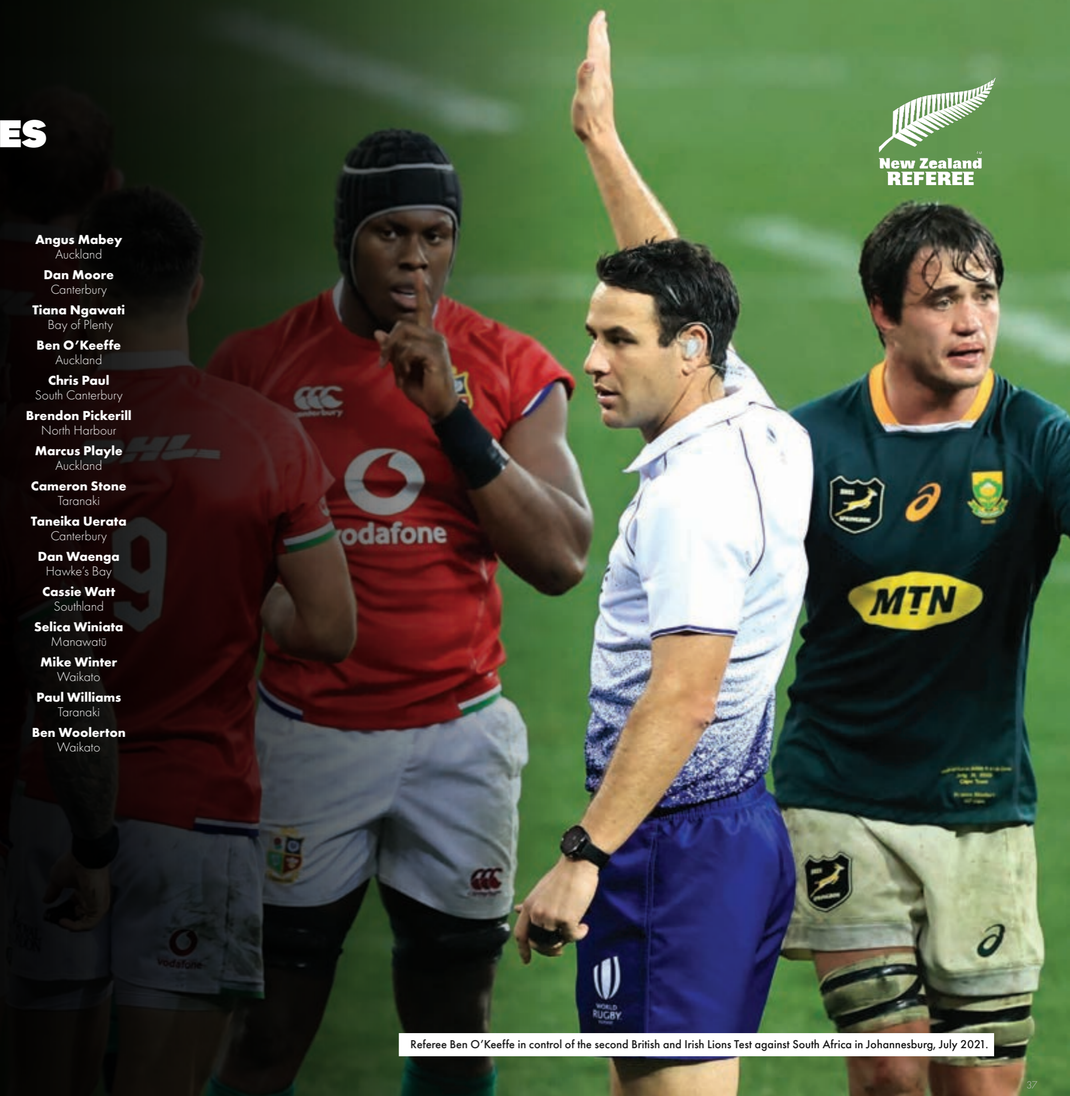
Referee Ben O'Keeffe in control of the second British and Irish Lions Test against South Africa in Johannesburg, July 2021.