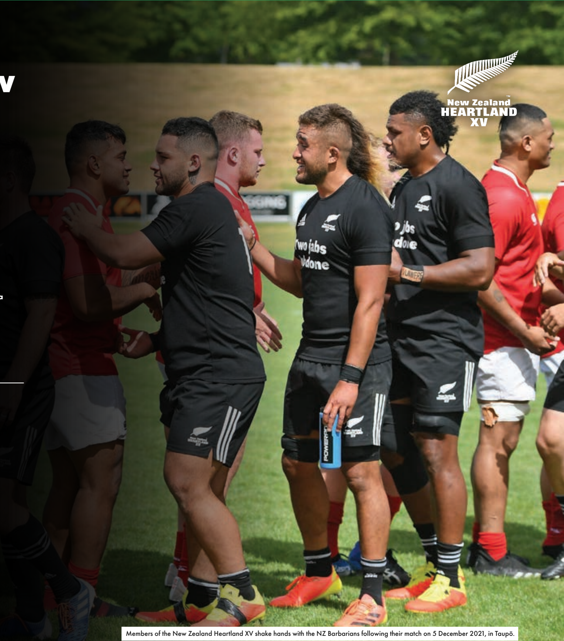
Members of the New Zealand Heartland XV shake hands with the NZ Barbarians following their match on 5 December 2021, in Taupō.