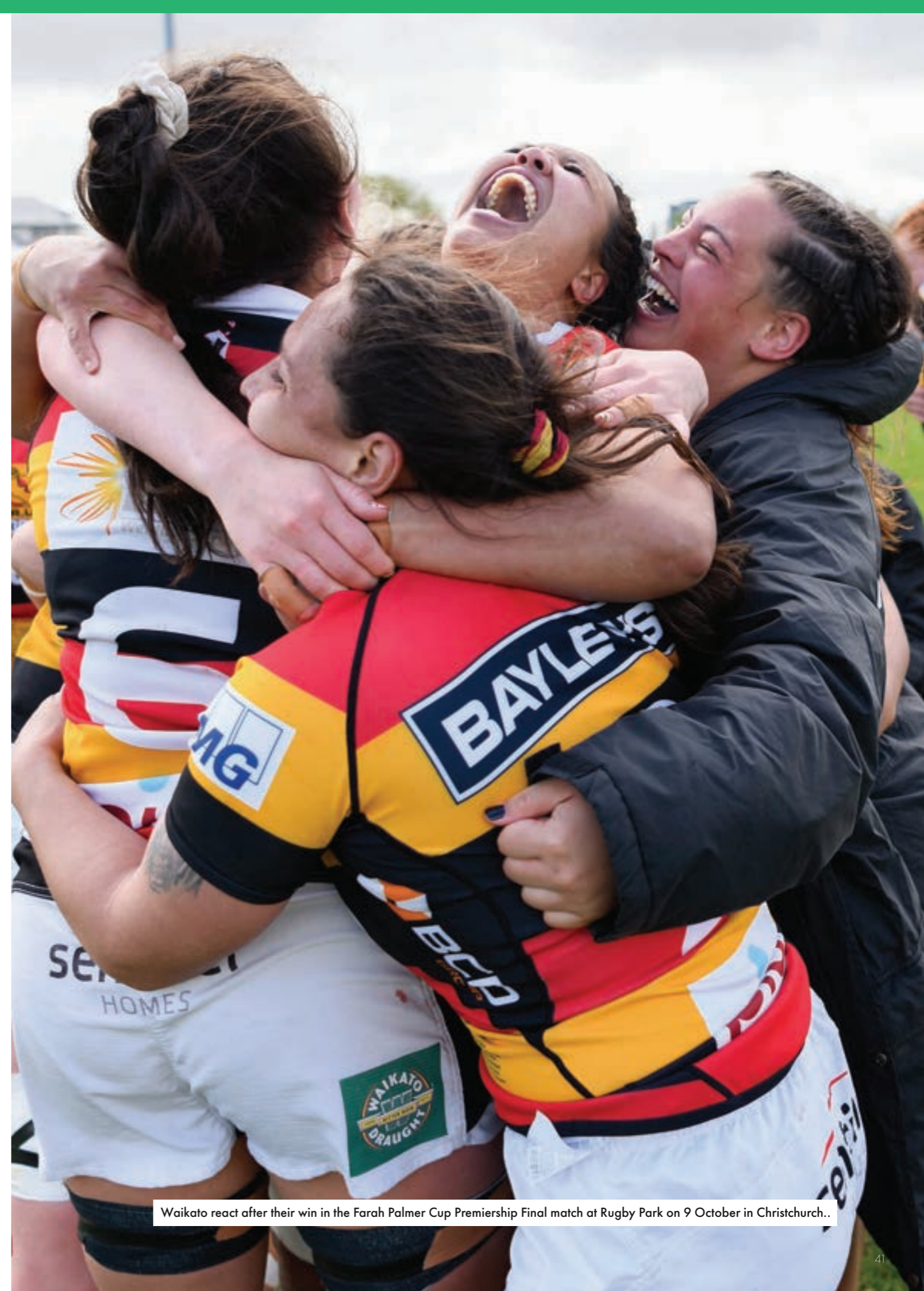
Waikato react after their win in the Farah Palmer Cup Premiership Final match at Rugby Park on 9 October in Christchurch.