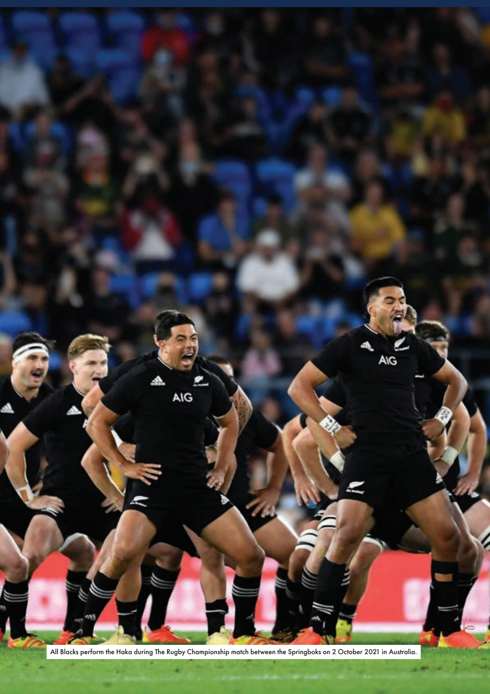
All Blacks perform the Haka during The Rugby Championship match between the Springboks on 2 October 2021 in Australia.