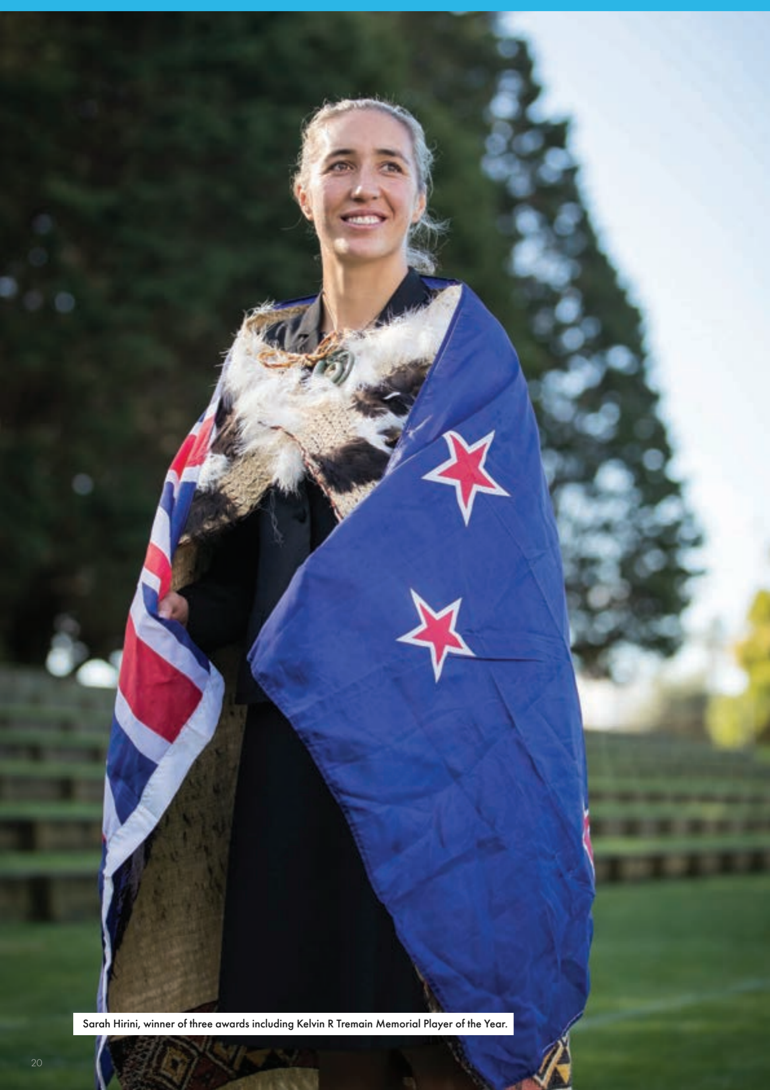
Sarah Hirini, winner of three awards including Kelvin R Tremain Memorial Player of the Year.