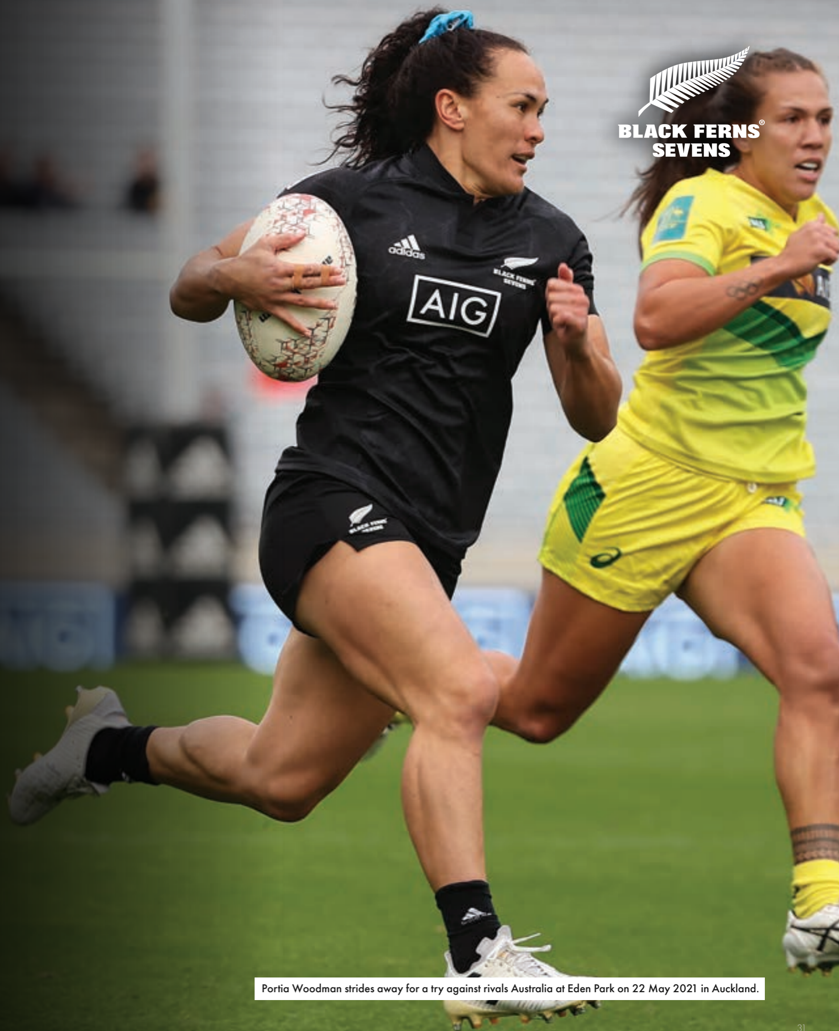
Portia Woodman strides away for a try against rivals Australia at Eden Park on 22 May 2021 in Auckland.