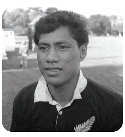
Waka Nathan (Ngāpuhi, Te Roroa, Waikato Tainui) All Black # 627 24 September 2021, aged 81